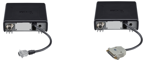
Optional OPC-1939 installation image Optional OPC-2078 installation image